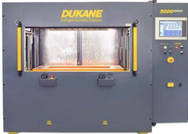
Table Size 72" (1829mm) by 24" (610mm)