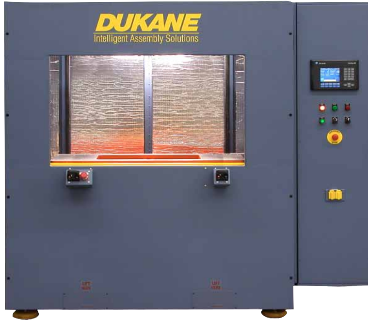
Table Size 52" (1320mm) by 24" (610mm)